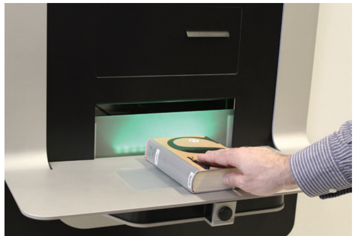
Lyngsoe Library Mate™ 2100 Self-return Exterior Kiosk