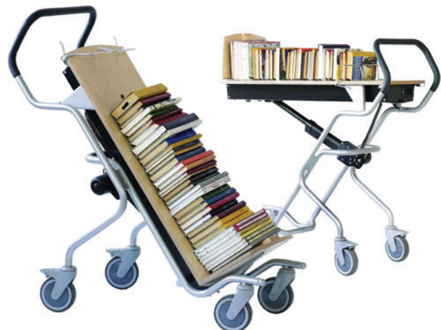
Lyngsoe Ergo Cart™