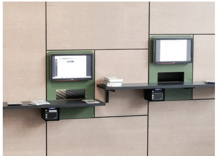
Lyngsoe Library Mate™ 1200 Self-return Interior Kiosk

Their focus on delivering unique and ergonomic AMH solutions provides support for staff welfare, and guards against the onset and recurrence of physical injuries from excessive bending and lifting. For example, as well as optimizing process flow, the Lyngsoe Ergo Cart™ offers multiple benefits directly related to its ergonomic design. With a Lyngsoe Turn Mate™ module, the full Ergo Cart - with materials already stacked spine out - is taken directly from the sorter to the library shelves for re-shelving. Here, the push of a button raises the materials to waist height, meaning no bending or awkward lifting is required during the single manual handling process.