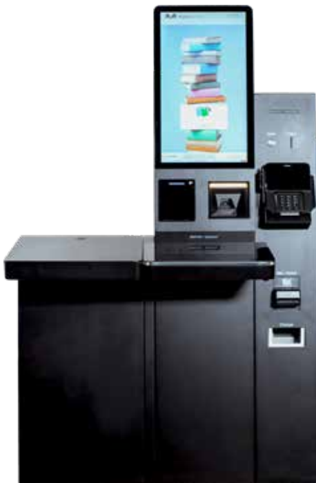
Software shown on X25 kiosk configuration with optional vending tower, and sidecar.

OneStop supports barcode and RFID patron cards and items. The software integrates with optional self-service solutions including fine payment, PC Reservation®, CloudNine® Reservation Service, print release, copy payment, item renewal, and library account management. NoveList Select for Self Checkout is an optional subscription.