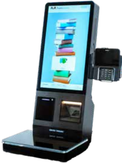
X25 countertop configuration

EnvisionWare's OneStop™ self-service circulation software combines an engaging interface for patron self-service with a customizable platform to showcase library news, events and more. Modern and intuitive, OneStop integrates with EnvisionWare's full suite of self-service solutions for time and print management, fine payment and more. The software works with EnvisionWare's hardware or your existing hardware to provide a cost-effective and flexible self-service solution. Manage the software centrally from a browser and create templates that can be copied to other stations.